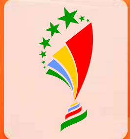
LAGOS STATE PRINCIPALS CUP